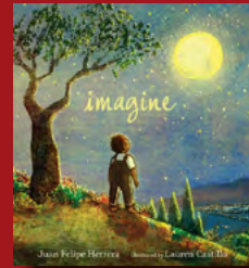
Imagine by Juan Felipe Herrera