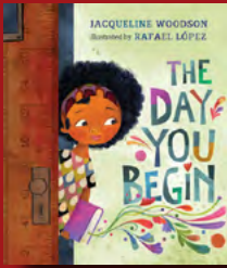
The Day You Begin by Jacqueline Woodson

When choosing books for this year's celebrations, focus on being inclusive of all your students and community. Below are just a few titles you can consider for your celebrations: