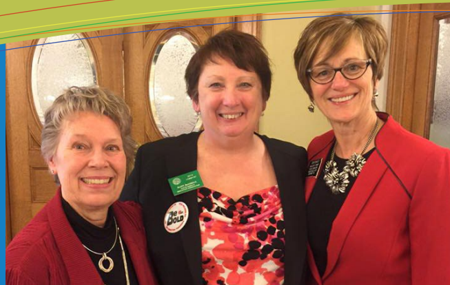
SDEA thanks Governor Dugaard, Representative Sly and Senator Soholt and all legislators who supported HB 1182.