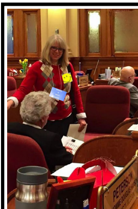
Lobbying in Pierre for education funding